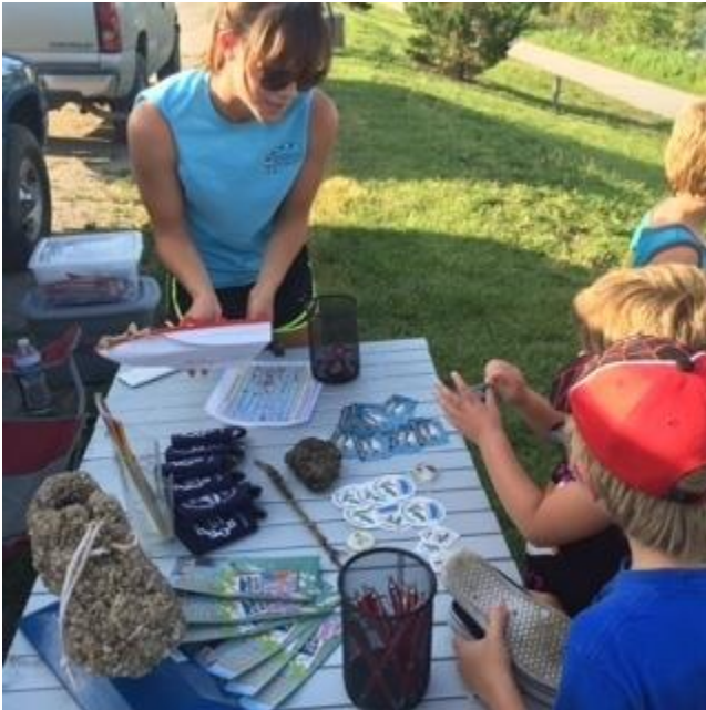
Technician Conducting Outreach

resource agencies and other states on outreach, management and research efforts. The NISP website has information on invasive species of concern in Nebraska and a reporting form the public can use to report invasive species sightings. The zebra mussel find at Lake Zorinsky in Omaha, NE was found because of a report via the NISP website by a Boy Scout. Learn more about invasive species of concern in the state and how you can prevent their spread at https://neinvasives.com/ .