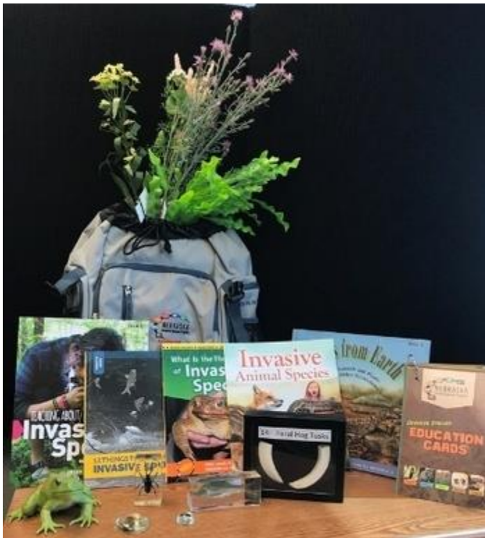
Invasive Species Education Trunk